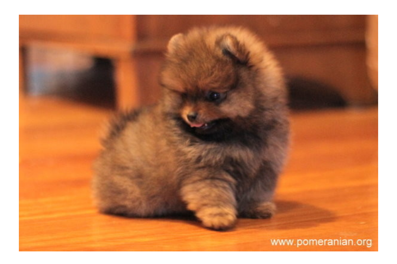
How to Potty Train a Pomeranian

The biggest mistake any Pom puppy owner can make is to bring a new Pom baby home, let puppy run around the home for a few days going to potty anywhere and then deciding to start house training a Pomeranian.